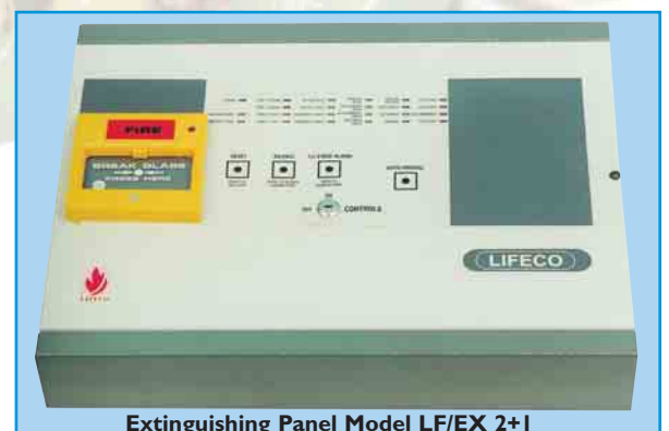
Extinguishing Panel Model LF/EX 2+1