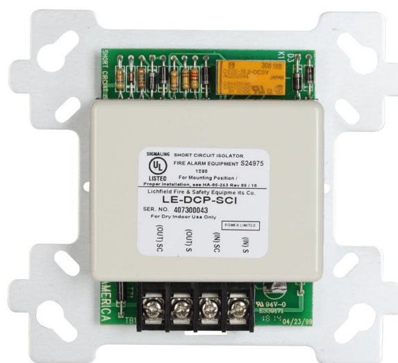
Back of a LE-DCP-SCI

The contractor shall furnish and install where indicated on the plans, the Lifeco LE-DCP-SCI short circuit isolator. The modules shall be UL listed compatible with Lifeco Digital Communications Protocol (LE-DCP) supporting control panel loops. The isolator module must be suitable for mounting in a standard 4" square electrical box. The isolator module must provide a yellow LED for indication of status.